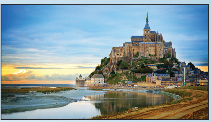
Join Outdoor Recreation for a trip to Normandy and Mont. St. Michel May 26-30.

Earn prizes for Gross and Net scores during a Four-Person Scramble on May 14 at the Rheinblick Golf Course. Cost is