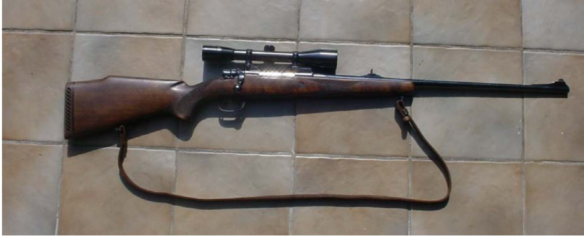
Repetierbüchse Mauser with scope 6x42

Single shot rifles ( einschüssige Büchsen ) Double barrel rifles ( Doppelbüchsen ) Bolt action rifles ( Repetierbüchsen ) Pump action rifle ( Vorderschaftrepetierbüchse ) Lever action rifle ( Unterhebelrepetierbüchse ) Semiautomatic rifles ( Selbstladebüchsen )