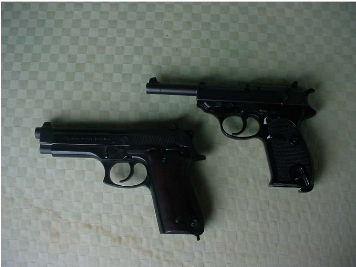
Taurus and Walther pistols

Single shot pistols ( einschüssige Pistolen ) Semiautomatic pistols ( halbautomatische Pistolen or Selbstladepistolen )