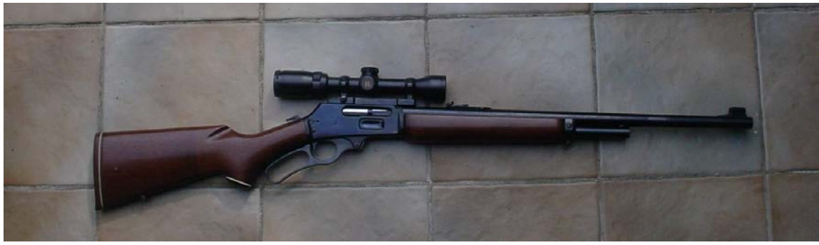
Unterhebelrepetierer with scope