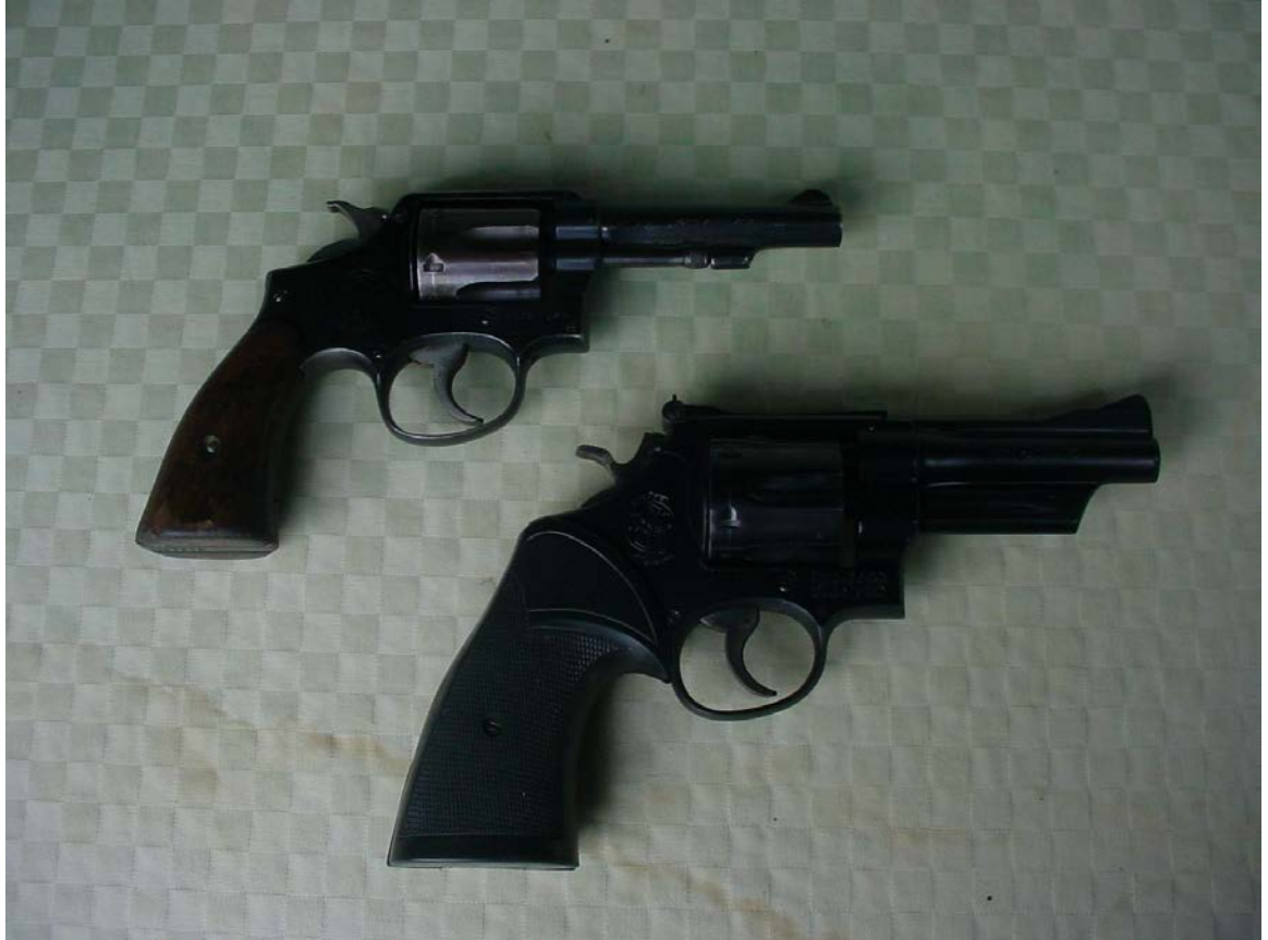
Smith & Wesson model 10 and model 28 revolver